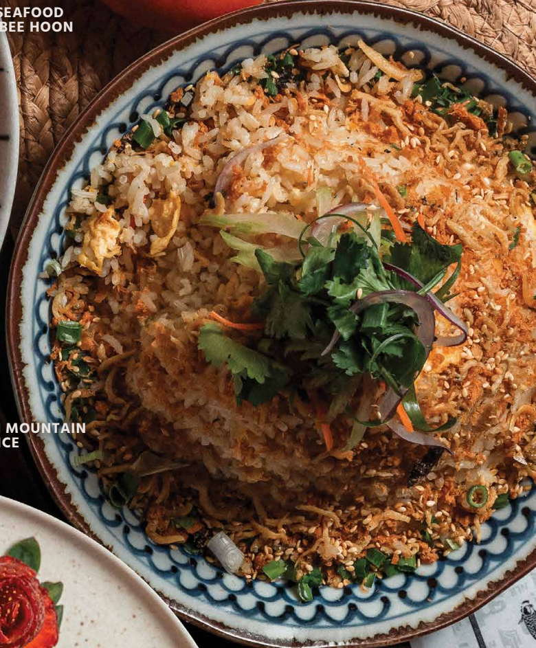
GOLDEN MOUNTAIN FRIED RICE