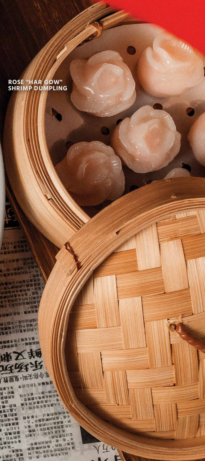
ROSE "HAR GOW" SHRIMP DUMPLING

新加坡新闻 1994年2月12日 星期六 节目丰富，老少咸宜 到滨海广场“挤一挤” 自然能感受佳节气氛 春来 0万人