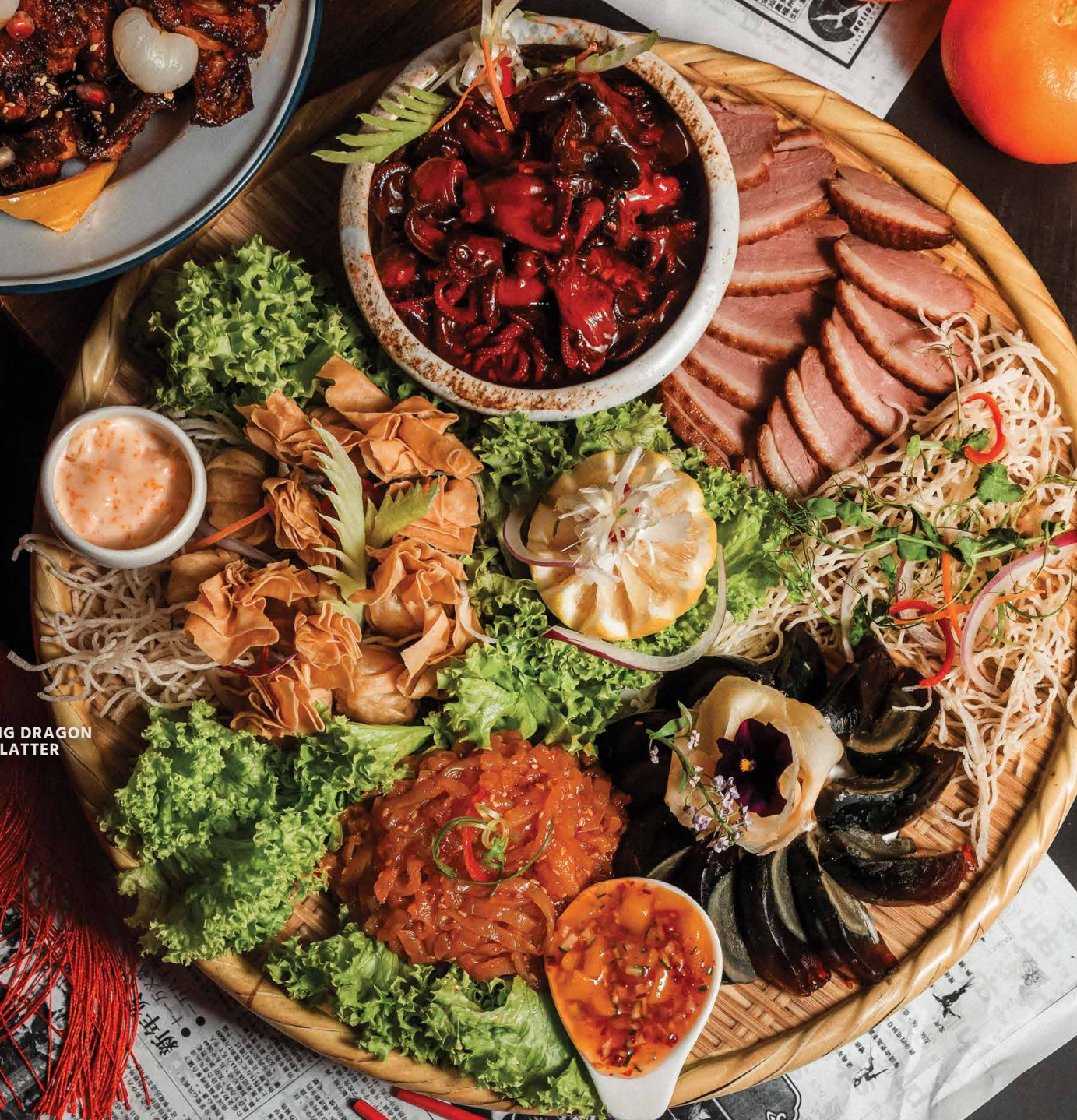
SOARING DRAGON COLD PLATTER