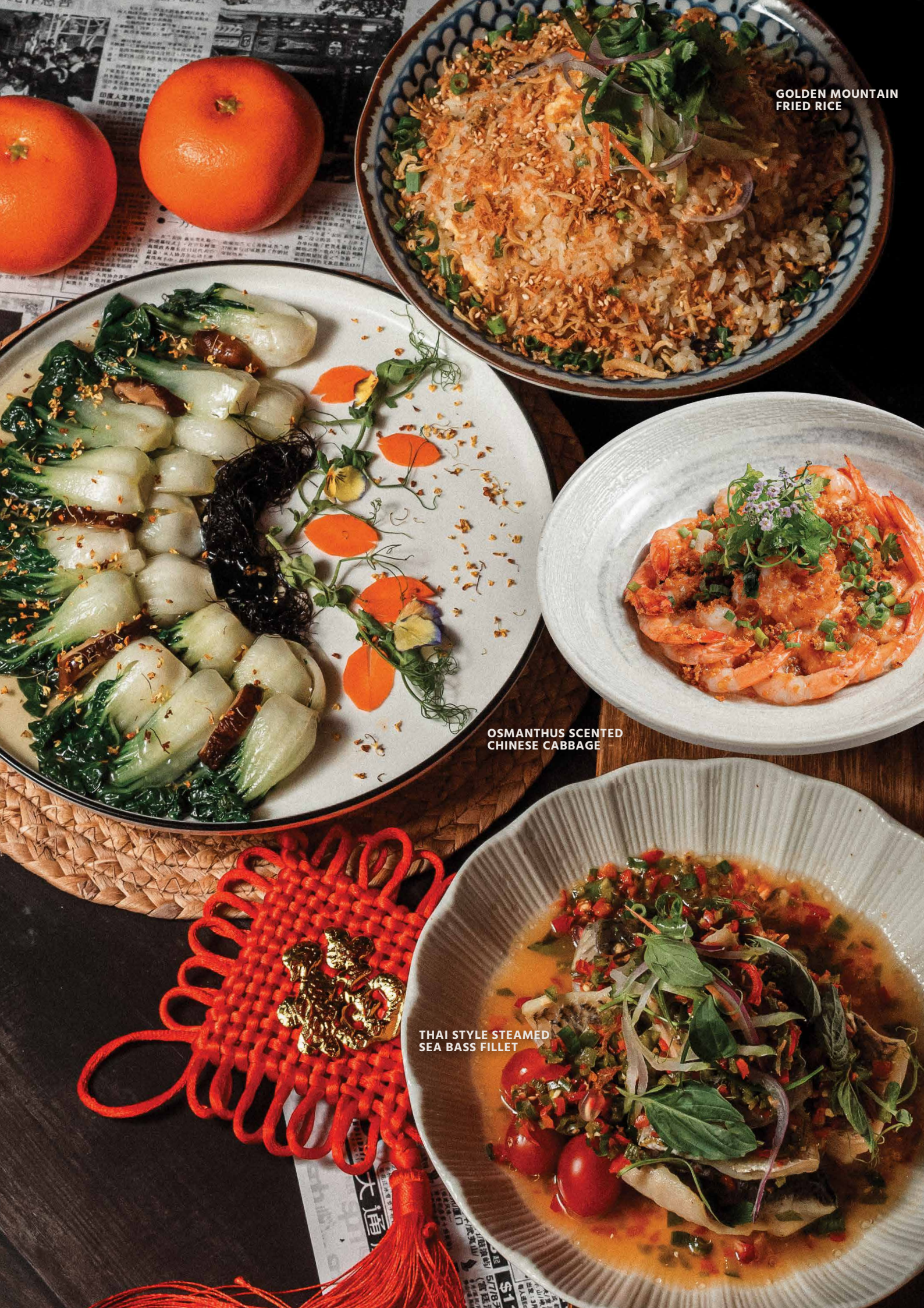
GOLDEN MOUNTAIN FRIED RICE