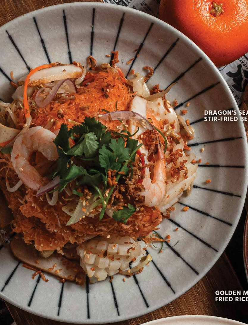
DRAGON'S SEAFOOD STIR-FRIED BEE HOON