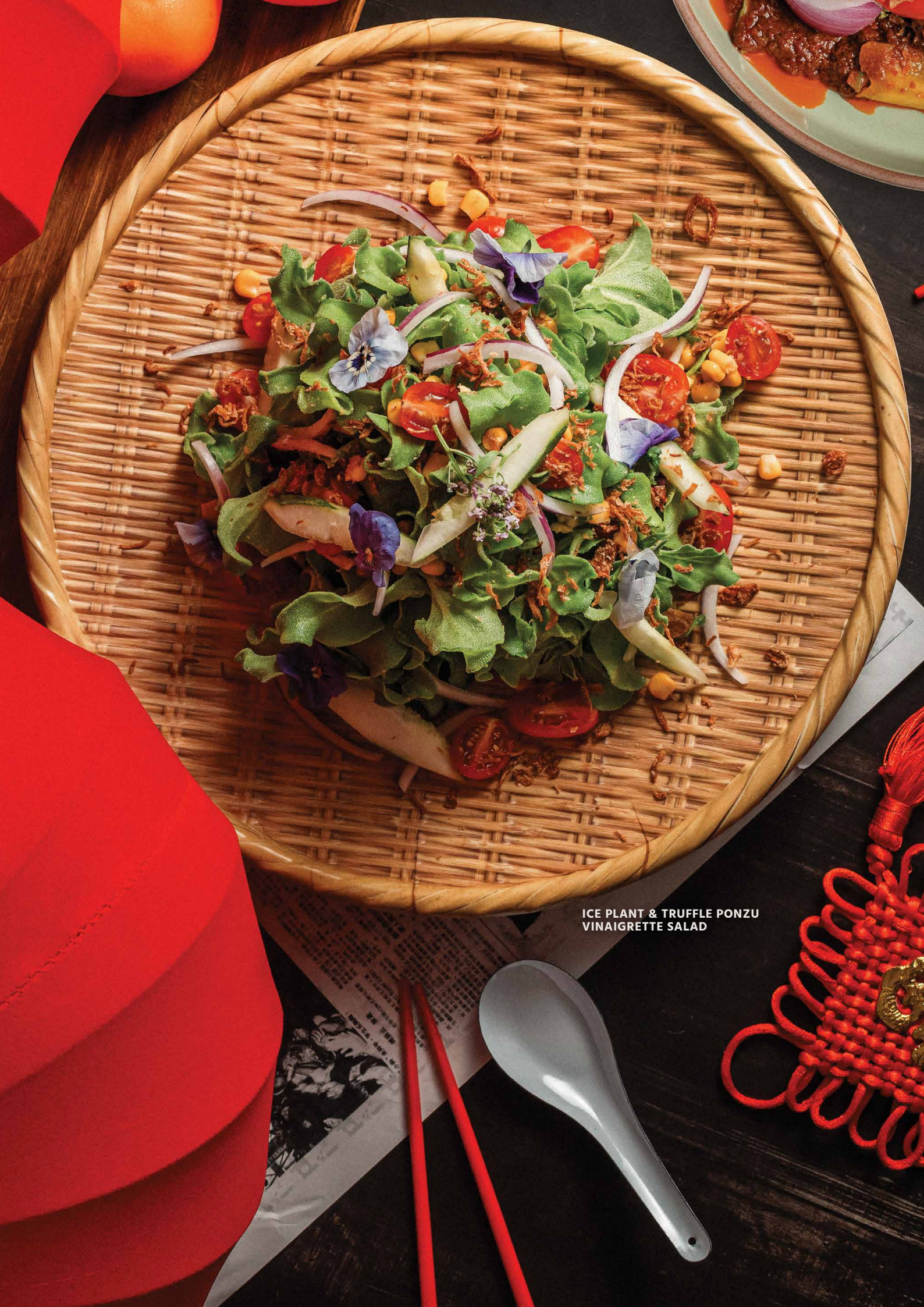
ICE PLANT & TRUFFLE PONZU VINAIGRETTE SALAD