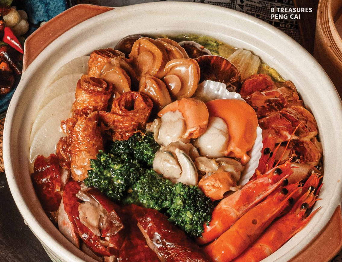
8 TREASURES PENG CAI