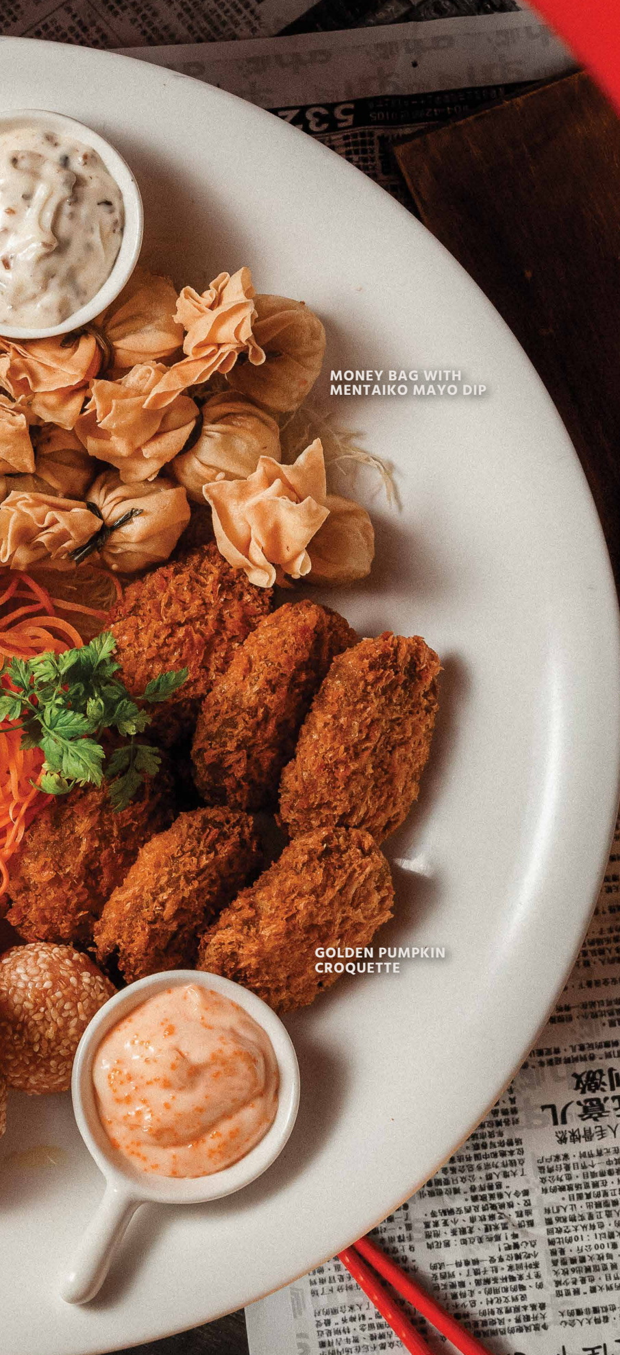
MONEY BAG WITH MENTAIKO MAYO DIP