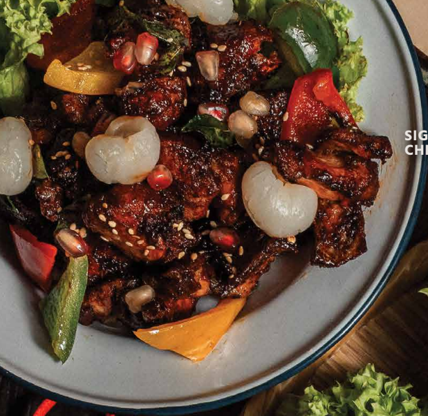
SIGNATURE FOUR SEASONS' CHICKEN