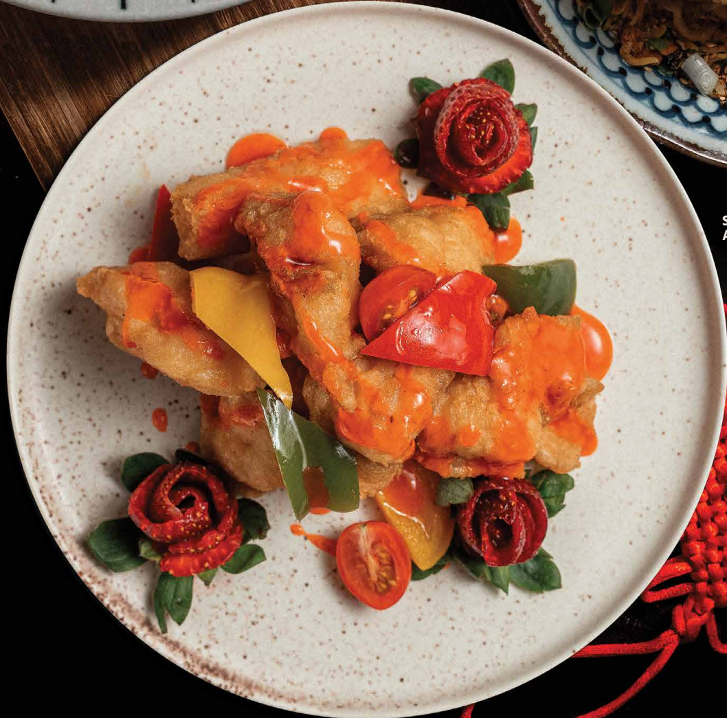
STRAWBERRY SWEET AND SOUR FISH FILLET