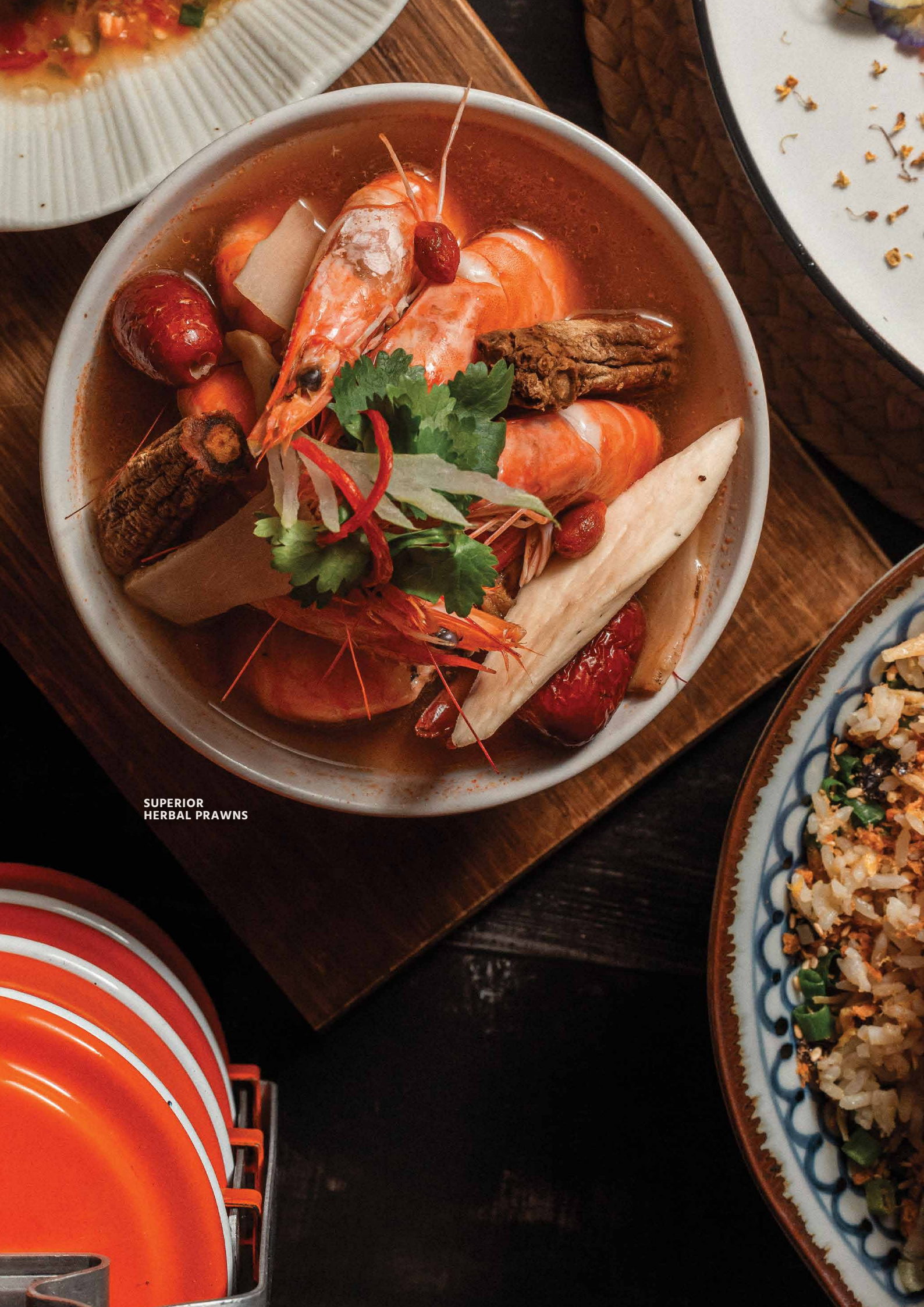
SUPERIOR HERBAL PRAWNS