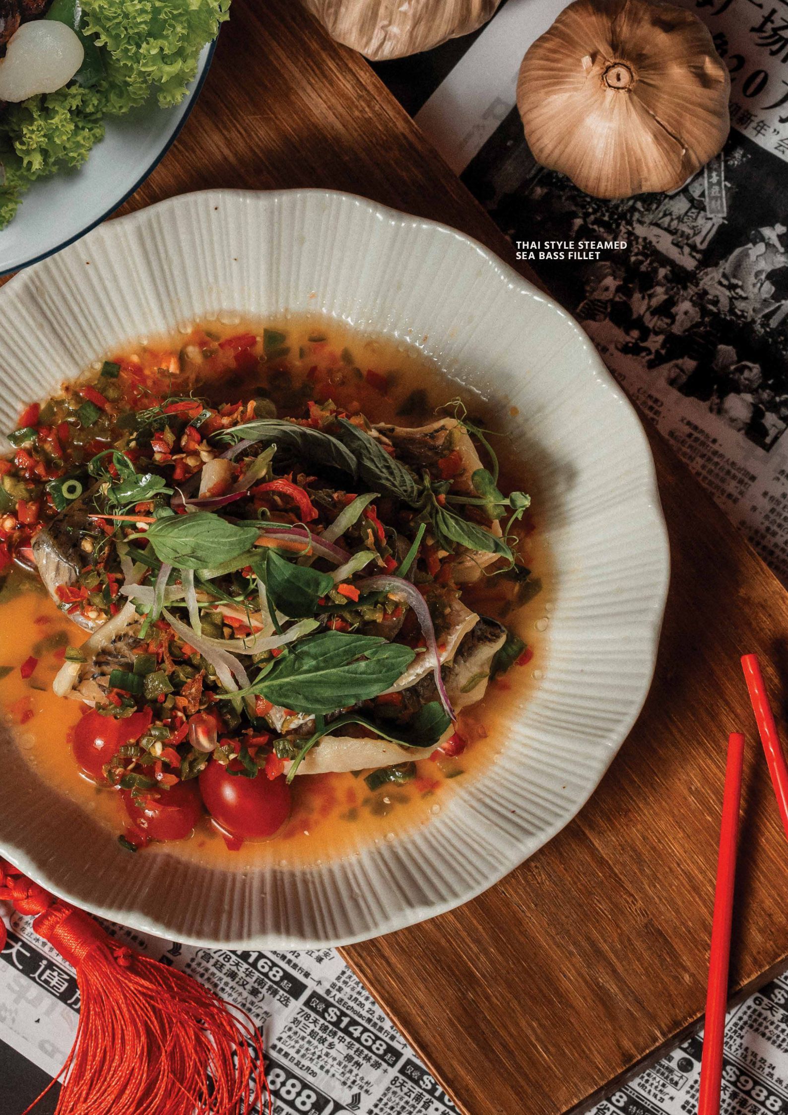
THAI STYLE STEAMED SEA BASS FILLET

大通加 168起 7/8天华南精选 刘三姐故乡—柳州 888起 1468起 7/8天锦绣中华桂林游 8天云南省·火 988起 6天 $988